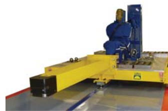
Integrated or Independent SLED System