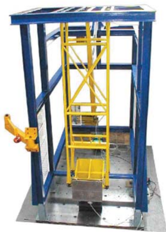
Bumper Testing Pendulum